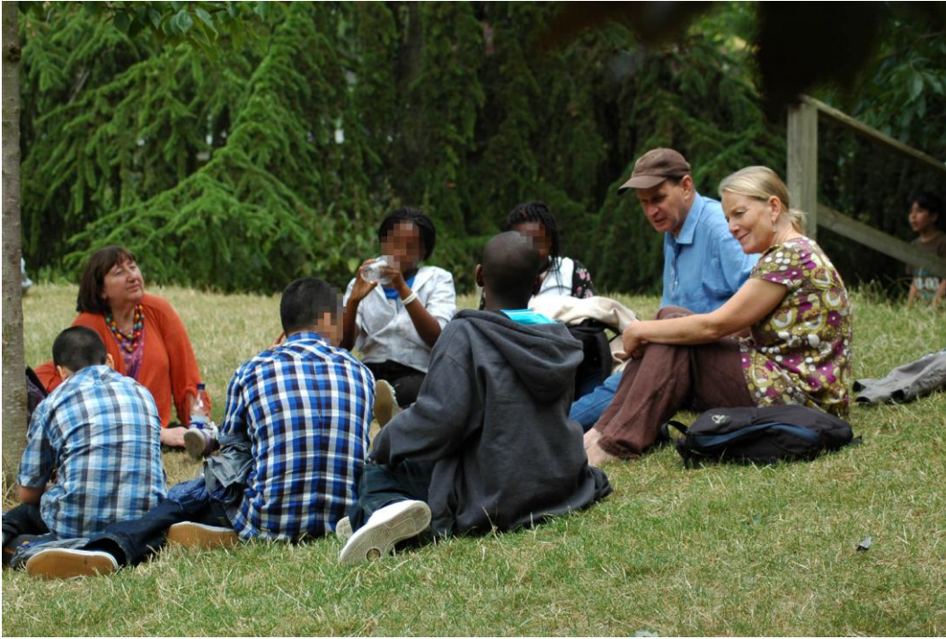
The Fortnightly Children's Group during the 2010 Summer Project in London

We have the opportunity during the projects to work intensively on themes that are central to our work at that time. During the summer we have for the past few years run the project with a residential period of five or six days in the countryside followed by a week of activities in London. We use direct and indirect ways of working, mostly arts-based and involving storytelling, making art and music and writing. There is also time to relax together. We have found that this combination of intensive therapeutic work and relaxation encourages the development of the capacity to reflect and to develop a sense of agency and the ability to address difficulties creatively.