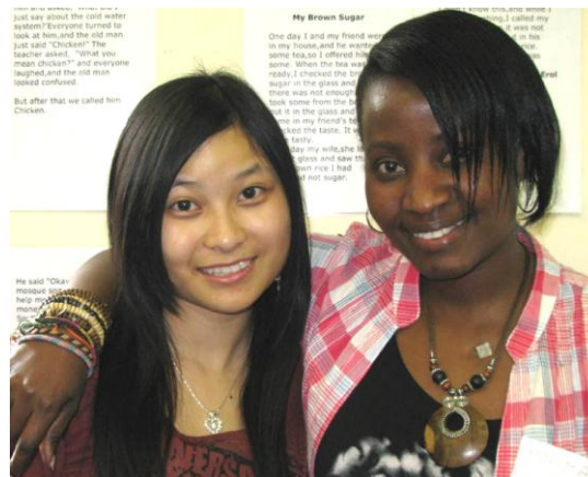
Two members of the Baobab community at a Baobab Centre exhibition and event in early 2011